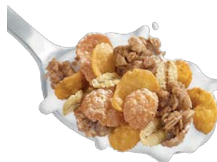
Cereals and oats