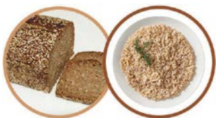
Brown bread and brown rice

To stay healthy, you need fibre from a variety of sources, such as: