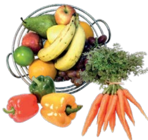
Fruit and vegetables